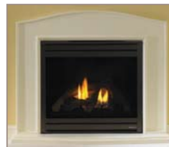
Laurent Cast Mantel and hearth

*Cover photo shown with painted Kenwood mantel, optional raised hearth base, marron brown marble and Halston operable doors in new bronze finish