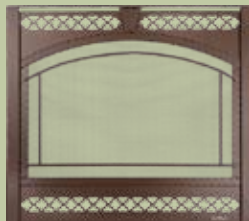
Chateau Deluxe Front Overlap Fit