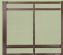
Halston Operable Doors Overlap Fit