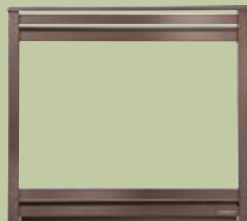
Aero Front Inside Fit