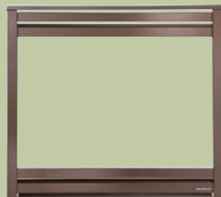
Aero Front Inside Fit