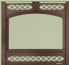
Chateau Deluxe Front Overlap Fit